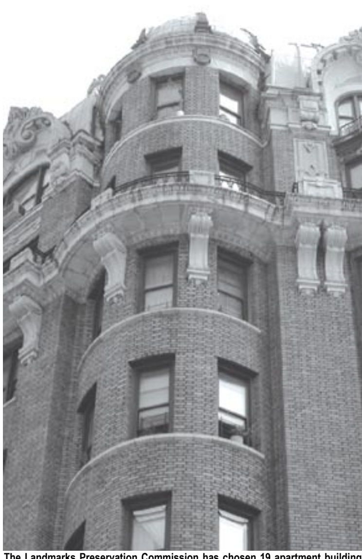
The Landmarks Preservation Commission has chosen 19 apartment buildings and one duplex building as a proposed Historic District dubbed Audubon Park in lower Washington Heights. Pictured above is the Sutherland building.

With a district, said Tierney, every building included is